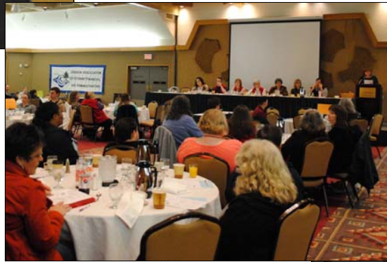
The President addresses the membership during the annual business meeting.